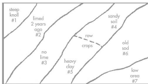
EXAMPLE 50 ACRE AREA

Low spots, trouble spots, and areas with obvious differences in soil type should be treated as separate sampling areas. Also, areas that have been treated differently in the past should be sampled separately. In areas where past treatments and soil types are uniform, limit the sampling area to 8 acres in size. Make a permanent field sampling map for your reference when test results are returned.